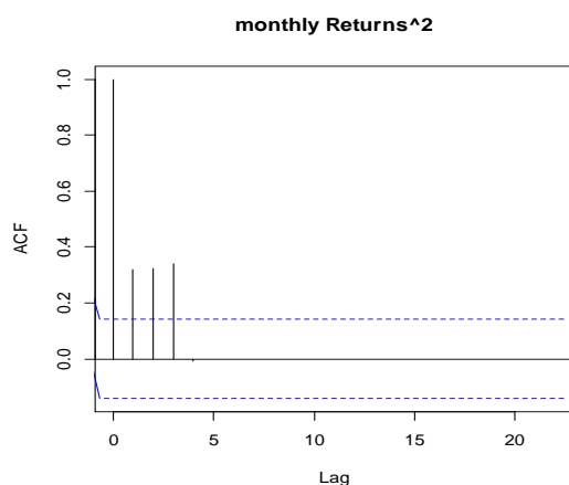
Figure 4.2: ACF Squared returns

The ACFs suggest significant serial correlation or in other words conditional heteroscedasticity in the standardized residual series. Big percentage changes occurred occasionally, but there were certain stable periods as shown in Figure 4.10 and 4.11. Figure 4.12 shows sample residence debt levels and clearly the series has no serial correlation. This findings are consistent with that of (Davis & Presno, 2014) on Capital Controls as an Instrument of Monetary Policy saying Large swings in capital flows into and out of emerging markets can potentially lead to excessive volatility in asset prices and credit supply thus need for the use of capital controls. The findings revealed that volatility of inflows has a positive influence on monetary policy in Kenya. The findings are supported by the coefficient determination which shows that the variations in volatility of inflows is explained by money supply and interest rates in the short term.